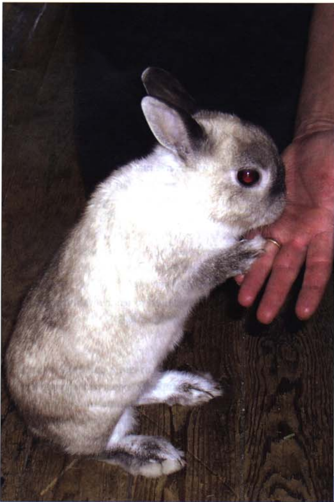
Giving '10' is a variation on giving 'five' whereby the animal places both paws on your hand. This trick builds upon the initial target training.

For example, an owner is trying to teach her pet rat to come to the door of its cage. It does so, but by the time the owner arrives with a food treat, the rat is frustrated with waiting and is chewing on the door. The owner gives the treat because the command was obeyed, but the animal associates the reward with chewing on the door. So, the owner has inadvertently taught her pet to chew on the door to get a treat!